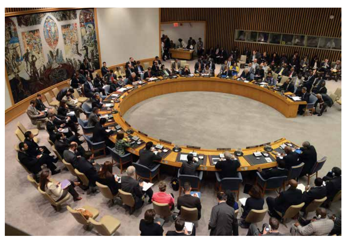
United Nations Security Council

United Republic of Tanzania, to the SADC-led Intervention Brigade in the Eastern DRC under the UN mandated peace mission (MONUSCO) to end the military attacks and violation of human rights perpetrated by the M23 rebels against the civilian population. This intervention resulted in the M23 renouncing the rebellion and agreeing to enter into negotiations with the DRC government.